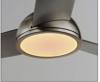
LED integrated dome